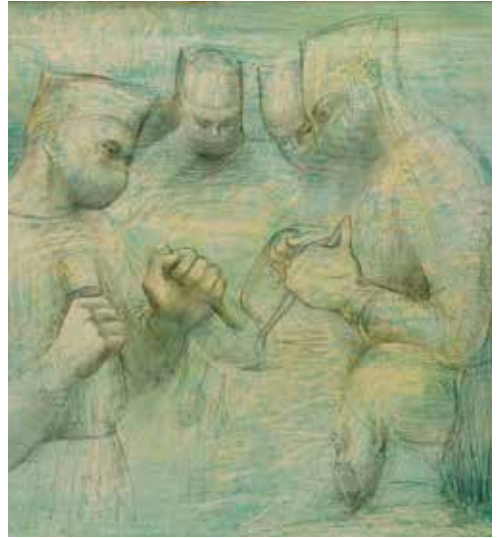
Barbara Hepworth, Drawing, 1947. Arts Council Collection, Southbank Centre, London

This exhibition includes works by LS Lowry, Peter Blake, Elisabeth Frink, Barbara Hepworth, Lucian