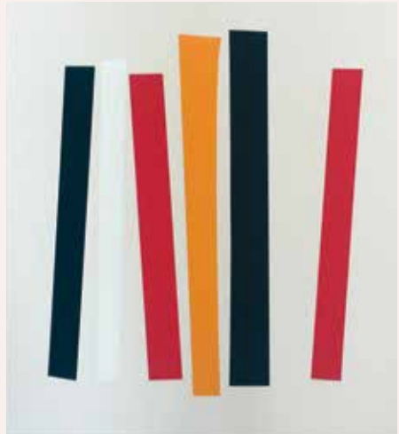
Terry Frost, Untitled, 2003