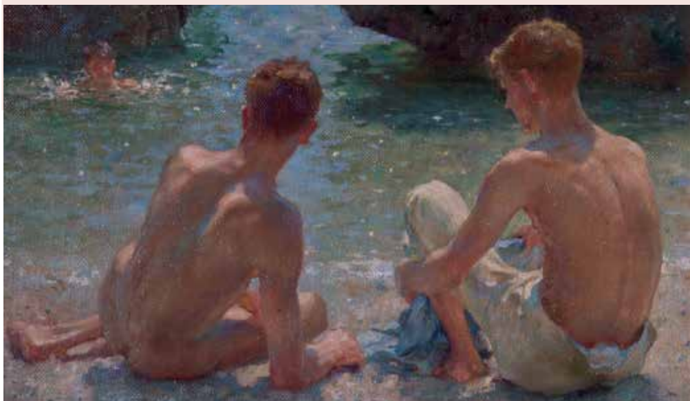
Henry Scott Tuke, The Critics , 1927, Oil on board. Currently on loan to Tate Britain for their exhibition Queer British Art which runs until 1 October.

We hope it will inspire more stories to be told through memories and objects so we can continue to collect and provide a platform for the previously unheard voices of LGBTQ+ Leamington.