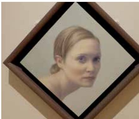
Neil Moore, The Ineluctable Modality of the Visible , oil paint, winner of the OPEN 2015

This year's exhibition will take place from Friday 14 April until Sunday 25 June and will showcase the work of local artists. Works submitted must have been completed after January 2016. Entries are welcome from a wide range of media including painting, sculpture, drawing, printmaking, photography, digital media and craft. Works will be selected by a panel of independent judges.