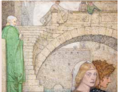
Frederick Cayley Robinson, The Bridge, 1905, mixed media on panel