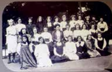
These young ladies were at school together c. 1910