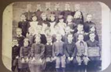
Class 3 at St Luke's School Leamington c. 1890