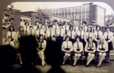
Leamington College 19