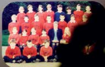
Year 5 at Cubbin 8