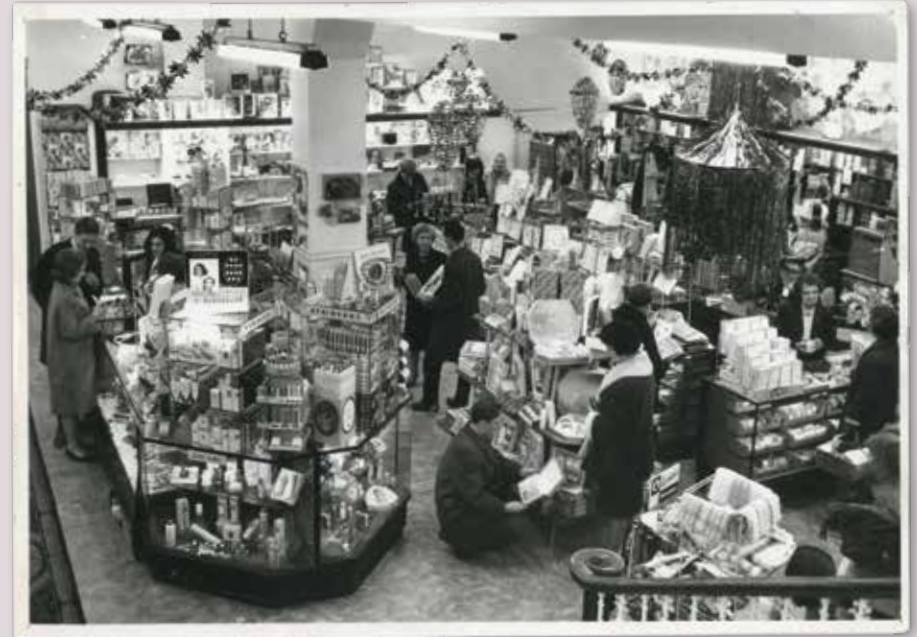
Christmas gift shop at Woodward's in the 1970s