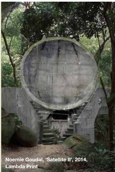
Noemie Goudal, 'Satellite II', 2014, Lambda Print

Noémie Goudal's work is inspired by removed and isolated places. She constructs fictional photographic landscapes. The resulting works exist in a state between illusion and reality, with ambiguity to where they truly belong. This work will be displayed in the main gallery to coincide with the opening of the Camouflage exhibition (22 July – 16 October 2016). The University of Warwick Art Collection have acquired the related artwork in the series Satellite I .