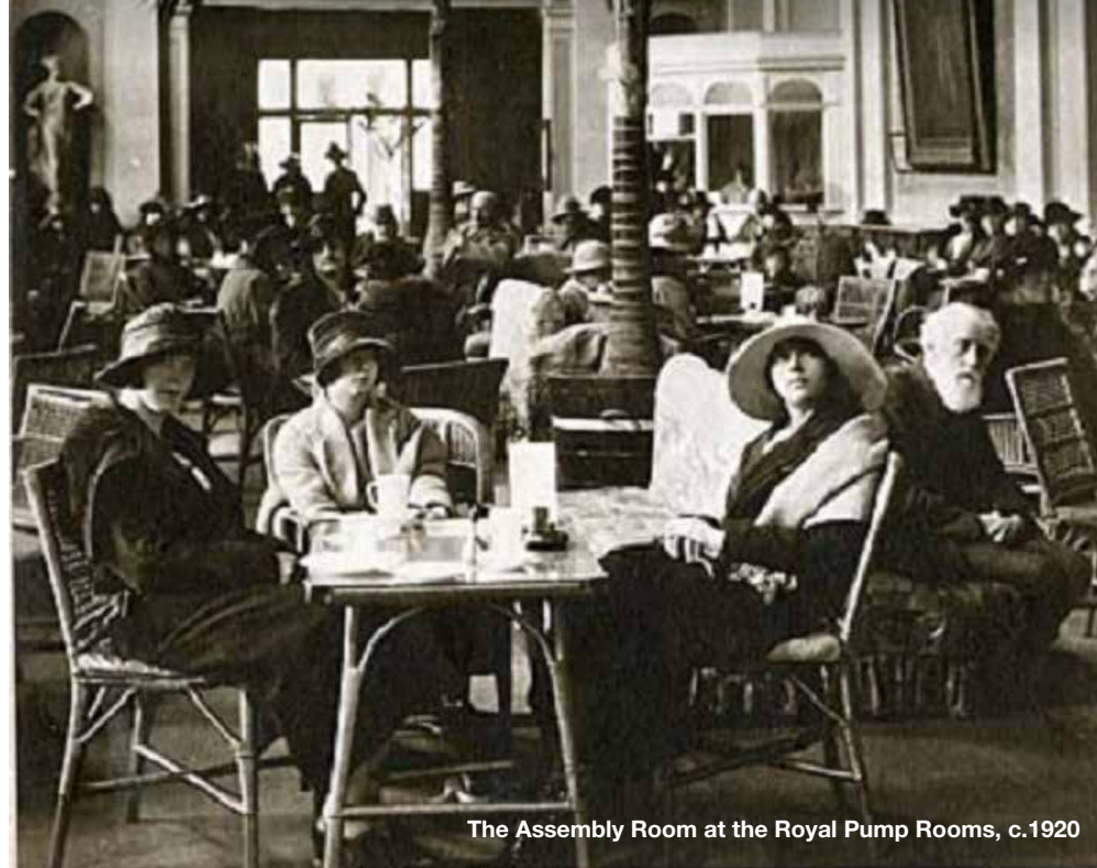
The Assembly Room at the Royal Pump Rooms, c.1920

Tickets are £18 per person and can be booked online via the Royal Spa Centre website or by calling 01926 742700.