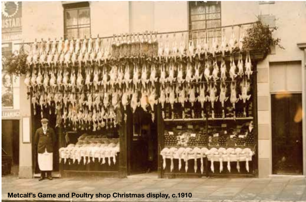
Metcalf's Game and Poultry shop Christmas display, c.1910

With fun interactives, dressing up, and the chance to see the neon sign from Toytown on display for the first time, there will be something for everyone to enjoy. Explore further by visiting the Shopping in Leamington Spa virtual trail on Historypin.