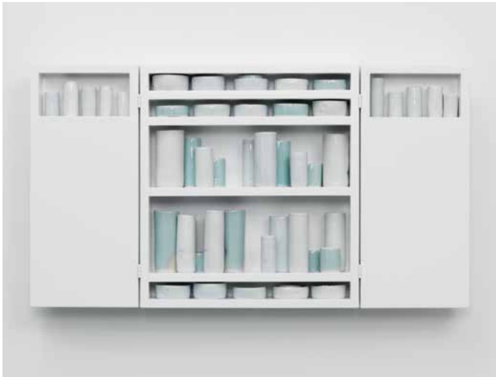
Edmund de Waal, water-shed , 2010, white lacquer cabinet, thrown porcelain vessels © Edmund de Waal

Between 2000 and 2005, Leamington Spa Art Gallery developed an art collection which explored the history of the Royal Pump Rooms as a former treatment centre and its collection of contemporary art, medical equipment and archives. 10 years after the project finished, the Medicate 2015 exhibition will revisit this unique group of artworks.