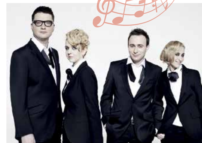
The Royal Quartet

Subscribe best seats for whole concert series - pay £98, saving £22 Individual tickets £20, £16 reserved and £13 unreserved