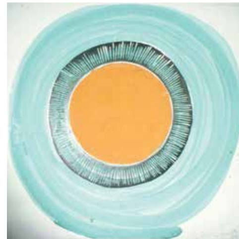
Terry Frost, Trewellard Suns , 1989, handpainted linocut on paper