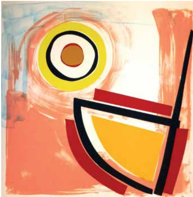
Terry Frost, Sun and Boat , c.1992-6, screenprint with hand colouring on paper

In 1915 Terry Frost was born in Leamington Spa. He grew up in a house on Rugby Road, attended the Central School on Leicester Street and did a number of jobs in the town before war broke out in 1939 and he was called up. In 1941 he was imprisoned in the Prisoner of War camp in Bavaria called Stalag 383. There he met the artist Adrian Heath and was inspired to paint. In 1944 the Art Gallery & Museum staged a small exhibition of paintings Frost had sent back from the camp and when he returned to Leamington in 1945 he