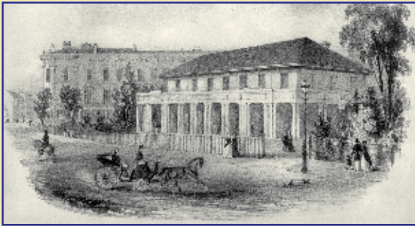
The Royal Pump Room and Victoria Baths, c. 1840