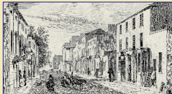
Bath Street, Bath Hotel, Theatre and New Assembly Rooms, 1822

In front of All Saints' Church is the site of the Old Well or Lord Aylesford's Well. A spring used for bathing and drinking was recorded here in 1480. It became renowned for the treatment of hydrophobia (rabies). In 1803 the Earl of Aylesford built a small stone well house; there was a charge for spa water dispensed inside while that outside was free. A new well house was built in 1813, improved in 1828, and rebuilt in 1891. It was demolished in 1961. Since 2007 the sculpture 'Spring' has marked the site of the original well. Cross the road and continue along Bath Street, stopping opposite Gloucester Street.