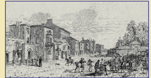
Copp's Hotel, High Street, The Market and Wise's Baths, 1822

and cold bathing, shower baths, a douche bath, a hot air bath and a vapour bath. The business was later taken over by James Gould and renamed Gould's Original Baths and Pump Rooms. Continue up Bath Street to the junction with High Street.