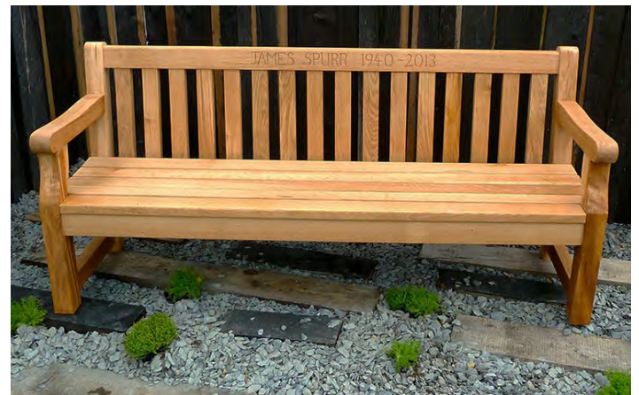
Chris Nangle Furniture – Classic Bench

Consider replacement of mesh bins in church yard, although these remain recessive to the church. Should these be replaced, ensure they are consistent with the Design Guide of the Fields.