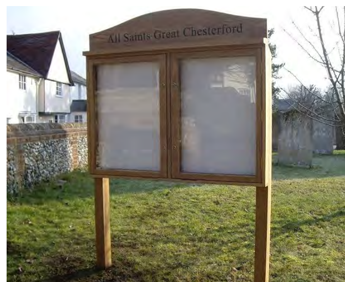
Fitzpatrick Woolmer – Freestanding notice board