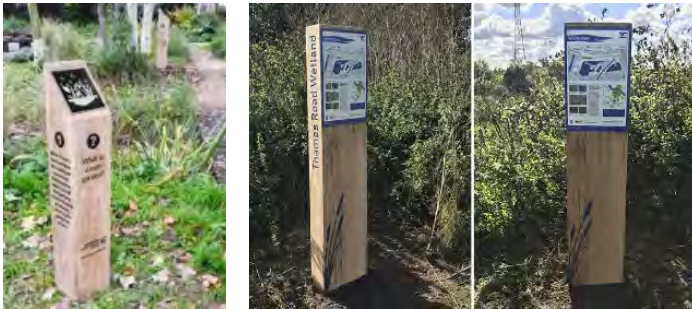
Landmark – Braemar monoliths and interpretative bollards

Plaques are used on the Abbey Fields ruins to provide a more detailed location of 'where you are' within the Abbey ruins. Updating these would provide greater legibility of the ruins. Choice of material is important, although existing plaques could be reused but inset within timber structures.