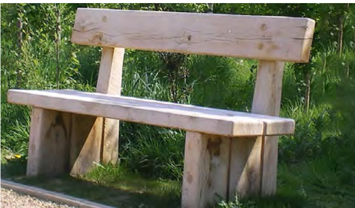
Chris Nangle – Heavy duty back bench