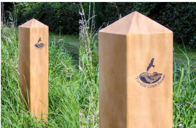
Landmark – County Waymarkers