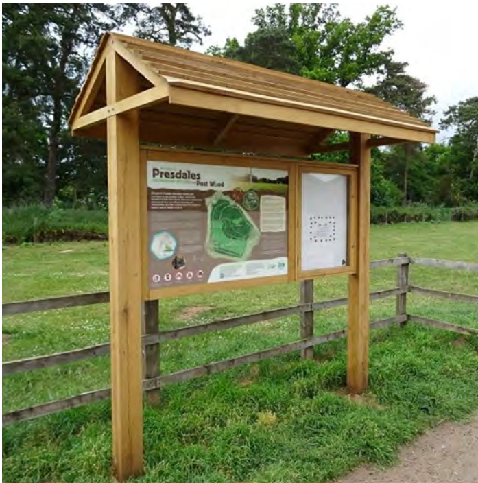
Fitzpatrick Woolmer – E Combination display