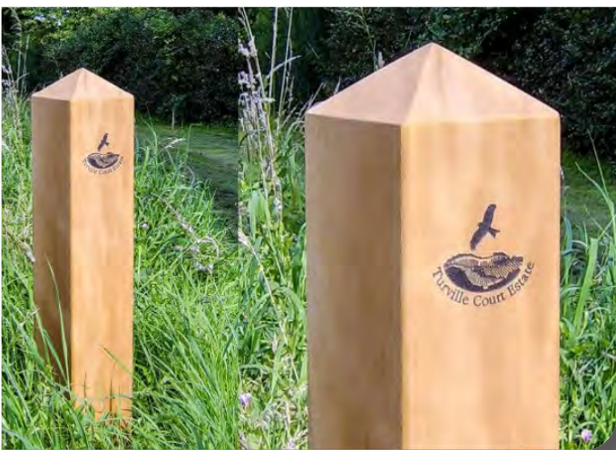
Landmark – County waymarker posts