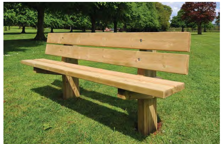
Broxap – Hatton Rustic