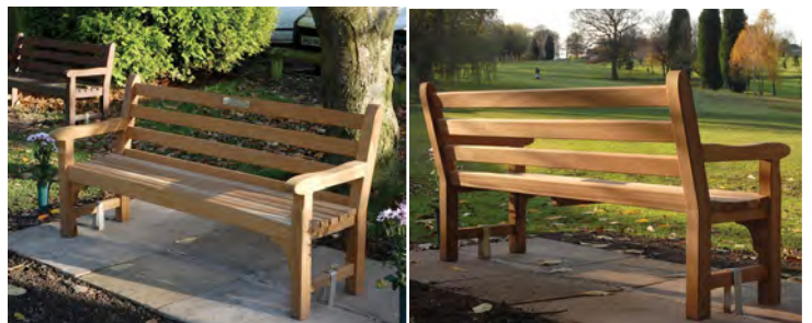
Broxap – Victoria Seat