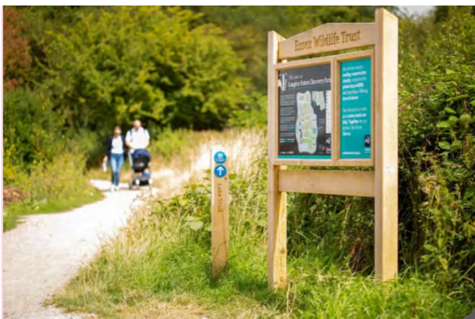
Landmark – Aberdeen Display