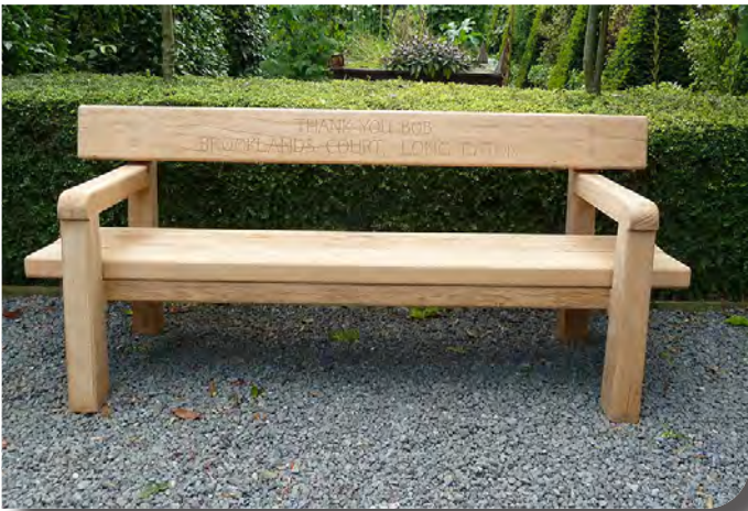
Chris Nangle – back bench