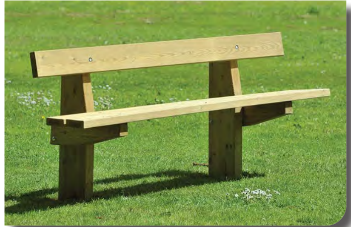
Broxap – Edale Rustic (currently used)