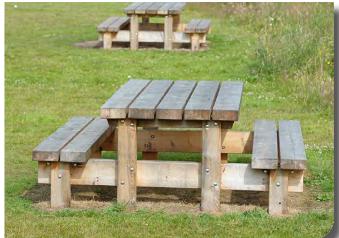
Broxap – Land Picnic Bench (not wheelchair accessible)