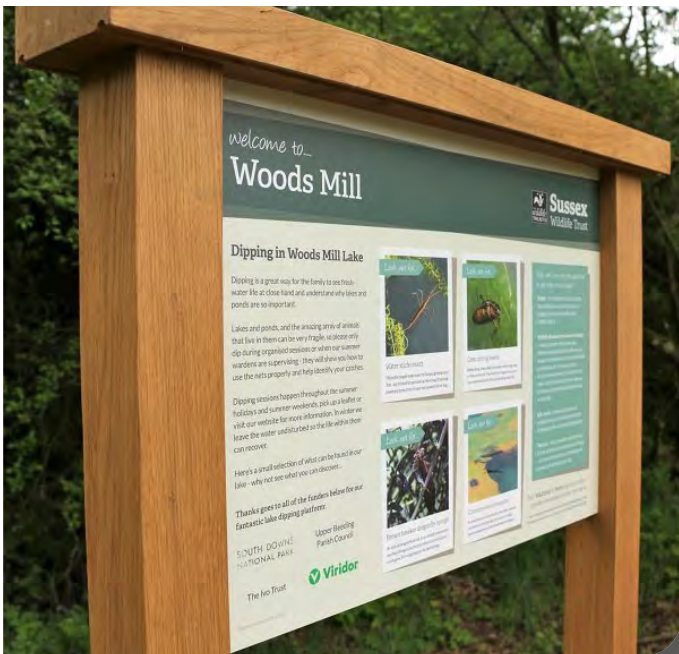
Fitpatrick Woolmer – Interpretation

An example of the content and the type of map is seen below. Clear and consistent maps throughout will provide a thorough understanding of the Fields and the location of important features, routes and a location guide.