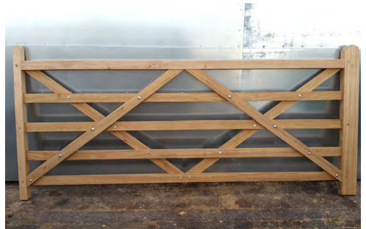
Ingestre Woodworks – 5 bar field gate (oak)

Replace A-frame gates to entrances with timber A-frame gates in keeping with the style of the Fields.