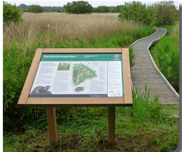
Fitzpatrick Woolmer – Wood Lectern

Lecterns are currently used throughout the Fields for the main historical information. These need updating, modernizing and replacing in keeping with the design style. Ideally these would be framed in timber, with timber posts.