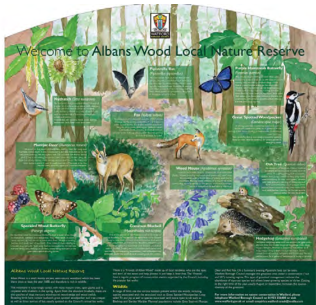
Redmason Signs – wildlife board

Lecterns may also be required for other information, such as key wildlife information. Consistency of material palette is important. An example of a wildlife board is shown below, with key information for visitors.