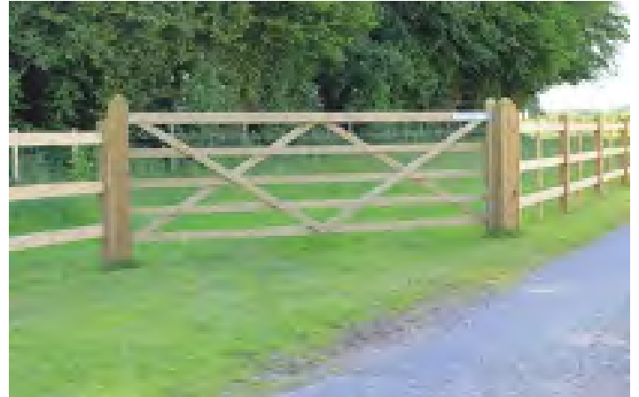
Jacksons Fencing – 5 bar field gate (softwood)