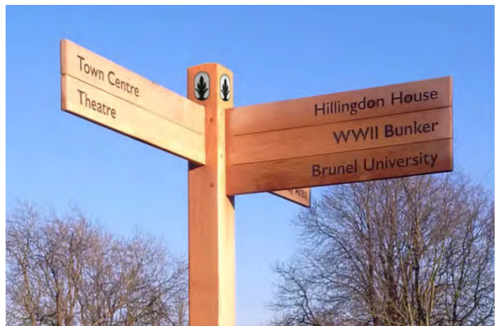
Landmark – Hillingdon Fingerpost