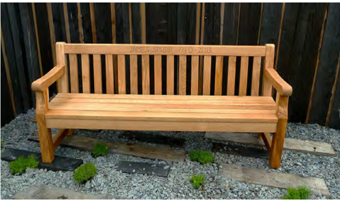
Chris Nangle – classic bench