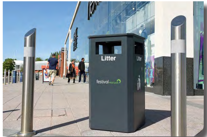
Broxap – Derby litter bin (to have minimal writing and council colouring to make it unique to the setting)