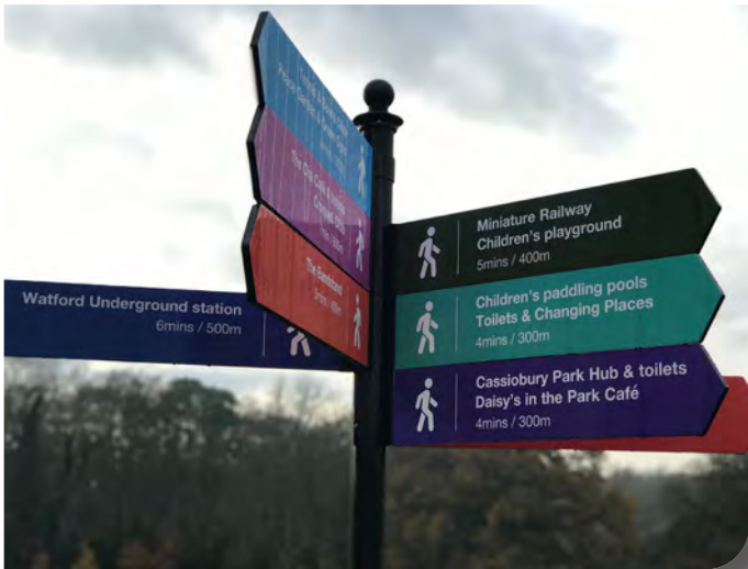
Redmason signage – finger post information

The messaging on the finger post is also important and to encourage more pedestrian engagement with the Fields. The finger posts need to be consistent in style, but also consistent in message and information.