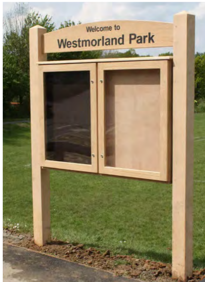
Landmark – Combination boards

Noticeboards to be in timber and located near to or combined with the primary entrance signage. These need to be freestanding at the Principal entrances, but located within the Fields. Noticeboards for positive news only and to be large enough to include all Fields' events and activities.