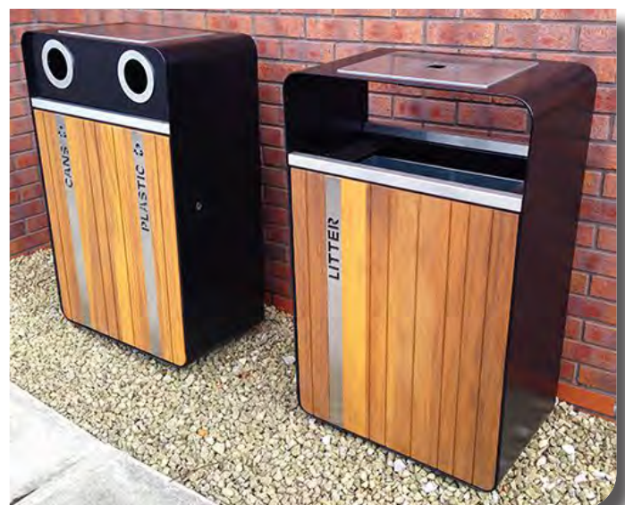
Bailey Streetscene – Ascot litter bin