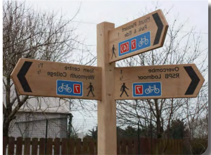
Landmark – County Fingerpost