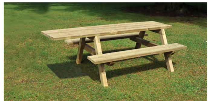
Broxap – Springfield Picnic Bench (wheelchair accessible)