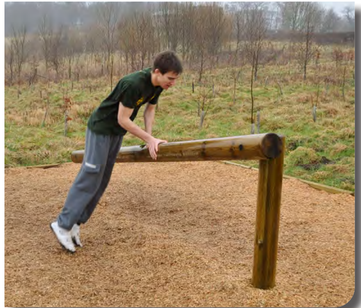
Playdale – Vault

Include more trim trail opportunities throughout the fields to create a more active route around the Fields. These could include: