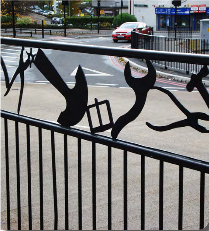
Street Furnishings Bespoke Guardrail

Pedestrian Guard rail on High Street to be replaced with a style more inkeeping with the character of the location. For the short stretch of guardrail on High Street, it would benefit a bespoke design that respects the history of the area. All metal elements of the proposed guardrail to be RAL 9005 black or RAL 9011 Graphite Black. However, choice of colour must be consistent throughout inclusive of street furniture and fencing.