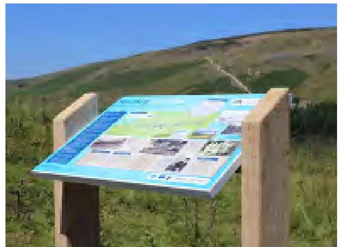
Landmark – Lyminster Slider

Each historical board would contain different information, a location map, but would be consistent throughout the Fields. There would be no need for more than one in any particular location.