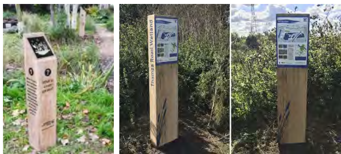
Landmark – Braemar monoliths and interpretative bollards.

Plaques are used on the Abbey Fields ruins to provide a more detailed location of 'where you are' within the Abbey ruins. Updating these would provide greater legibility of the ruins. Choice of material is important, although existing plaques could be reused but inset within timber structures.