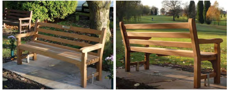
Broxap – Victoria Seat