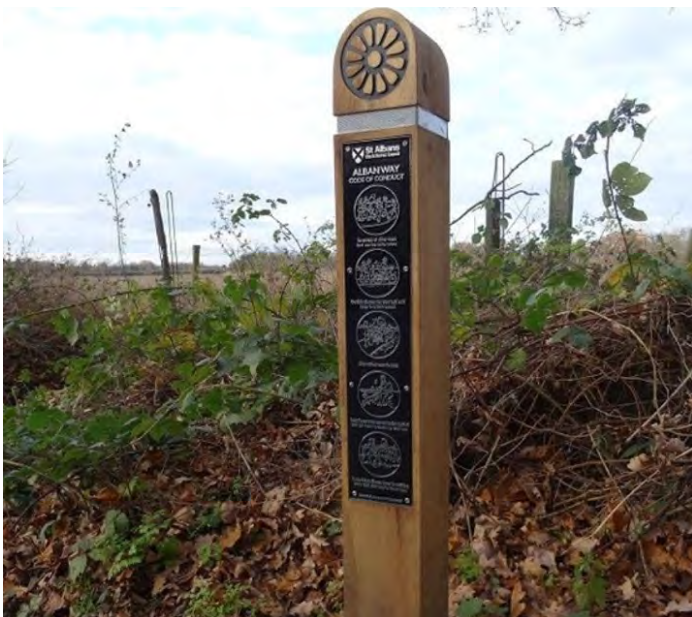
Fitzpatrick Woolmer Heritage Trail post

These structures can be used in such a way that these interpretative plaques are more accessible and visible to visitors, particularly in locations where they are more discretely placed.