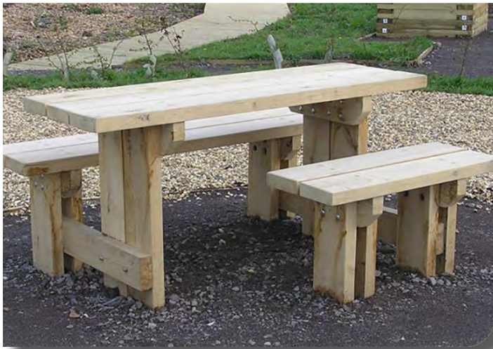
Chris Nangle – Green Oak Picnic Bench (adapted to be with or without wheelchair access)