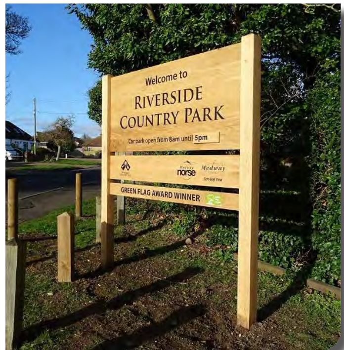
Fitzpatrick Woolmer – Entrance signs