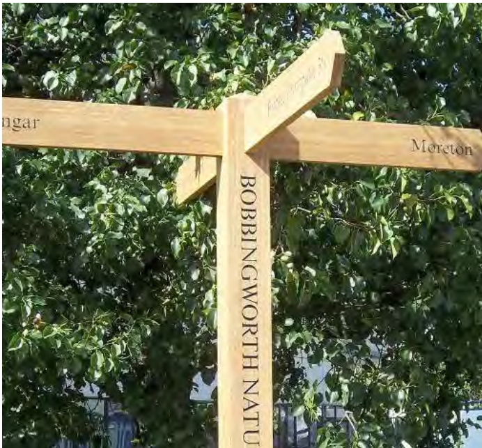
Fitzpatrick Woolmer – Rustic oak finger post

The messaging on the finger post is also important and to encourage more pedestrian engagement with the Fields. The finger posts need to be consistent in style, but also consistent in message and information.