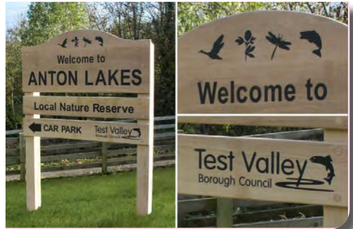
Landmark - Entrance Signs

It is important that Abbey Fields is advertised to vehicle users such that 'passers by' can see that there is something important to visit as well as welcoming all pedestrians to the Fields. Principal entrances are generally located at Abbey Fields car park, Castle Road, and Abbey Hill. These are major entrances to Abbey Fields and as such require a bolder approach to welcome visitors. Signage needs to be eye catching, clear, consistent and provide a very limited amount of information. Examples of entrance signage below.