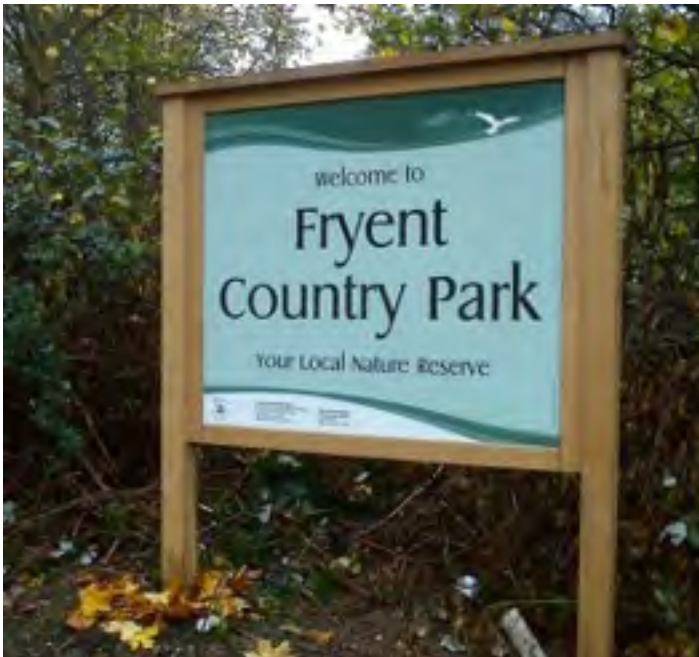
Fitzpatrick Woolmer – Bowman Option C

Welcome sign to St Nicholas Church to be timber framed similar to image below, with church colours to centre. This will provide consistency within the fields.