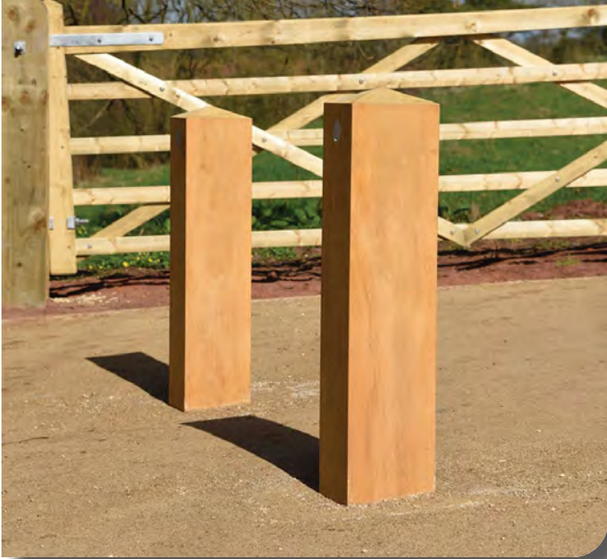
Broxap – pointed bollard