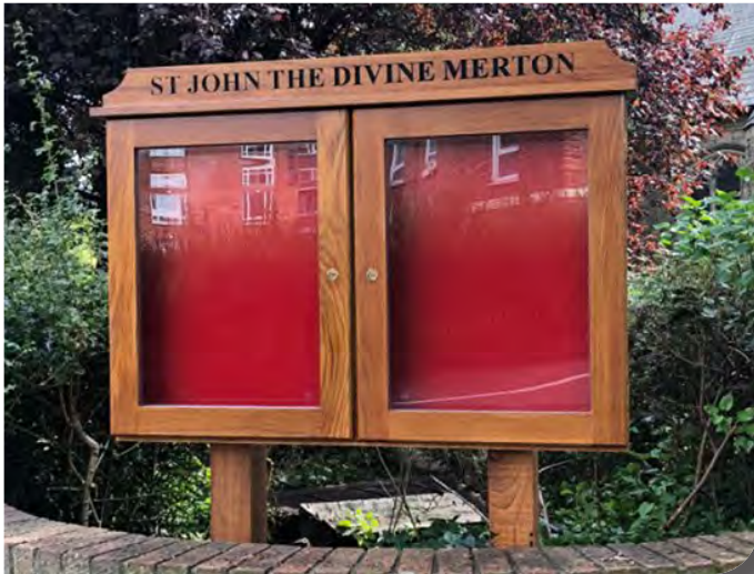
Notice Board Company

Church signage to be upgraded and inkeeping with the Fields and to use timber in character with the material palette of the Fields. Design style similar to below, however timber to be treated to match that of the Fields, i.e. light oak.