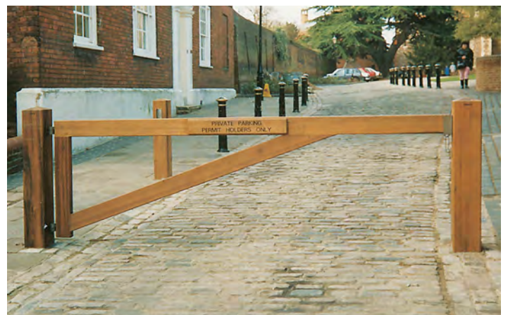
Woodscape – Abbey Gate

Replace A-frame gates to entrances with timber A-frame gates in keeping with the style of the Fields.