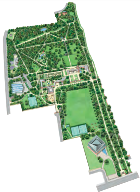
Redmason Signs – examples of detail of signage content and maps (material palette to be ignored)