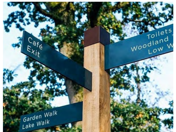
Fitzpatrick Woolmer – Grenadier finger post