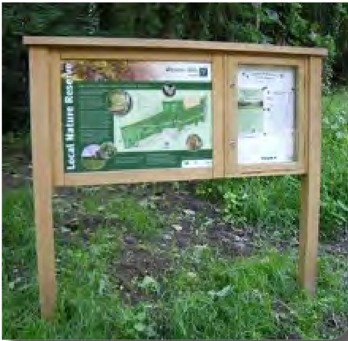
Fitzpatrick Woolmer – C Combination display