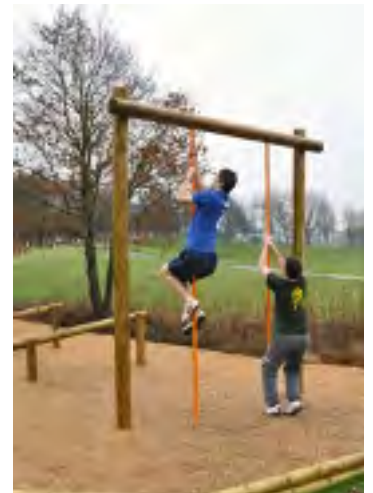
Playdale – Pole climb

Upgrade of the trim trail signage would be required, and this needs to be in keeping with the signage guide above.