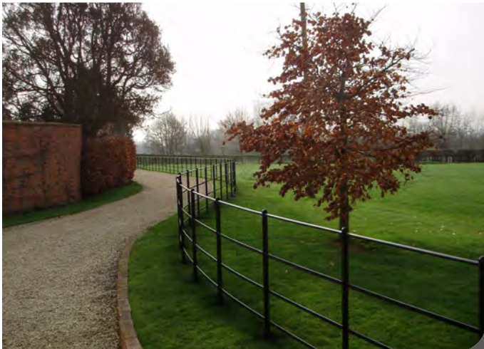
Brittania Estate Fencing – continuous welded estate fencing. Solid bar construction and not ‘modular’ in nature. Guaranteed longevity.