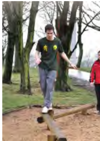
Playdale – Twin balance beam