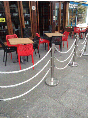
EXAMPLE OF ROPE & POLE BARRIER