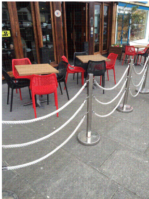
EXAMPLE OF ROPE & POLE BARRIER