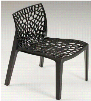
EXAMPLE OF BLACK GALAXY CHAIR