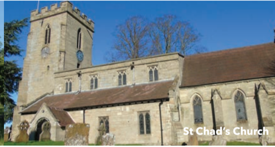
St Chad's Church