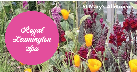
St Mary's Allotments