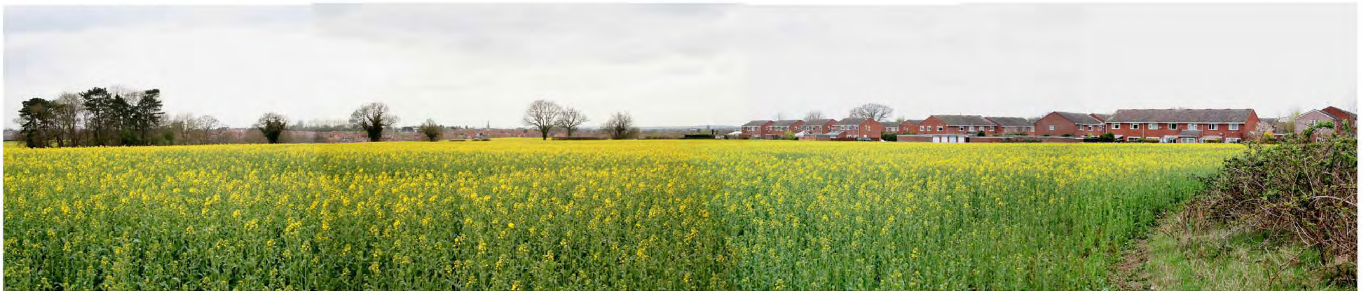
View north over potential development site at Radford Semele. A sensitive design approach would be required to ensure an acceptable relationship between new and existing development.