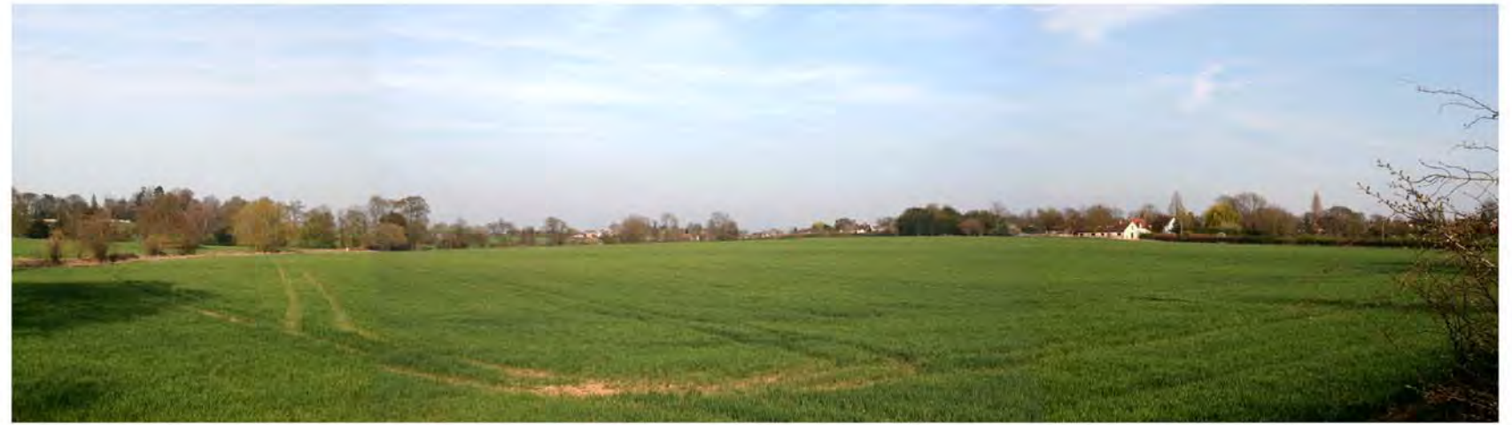
Views of Blackdown - looking east from Sandy Lane. Although the stream was dry in April 2012 - the streamcourse with mature trees is an important asset to protect and retain.