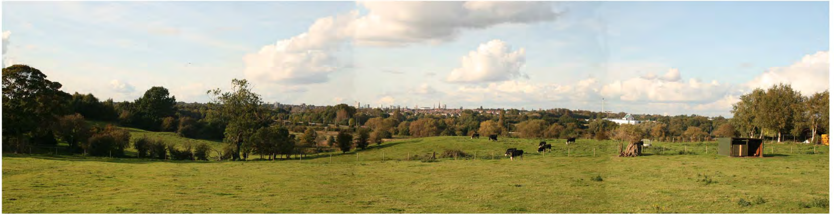
Looking north towards Whitley and Coventry from Rowley Road, Baginton. In spite of existing industrial sites and the busy road corridors, the locality has significant landscape assets - especially in relation to the river corridors. In any new development this green infrastructure needs to be retained and developed as a resource that can benefit Baginton and the communities to the north.