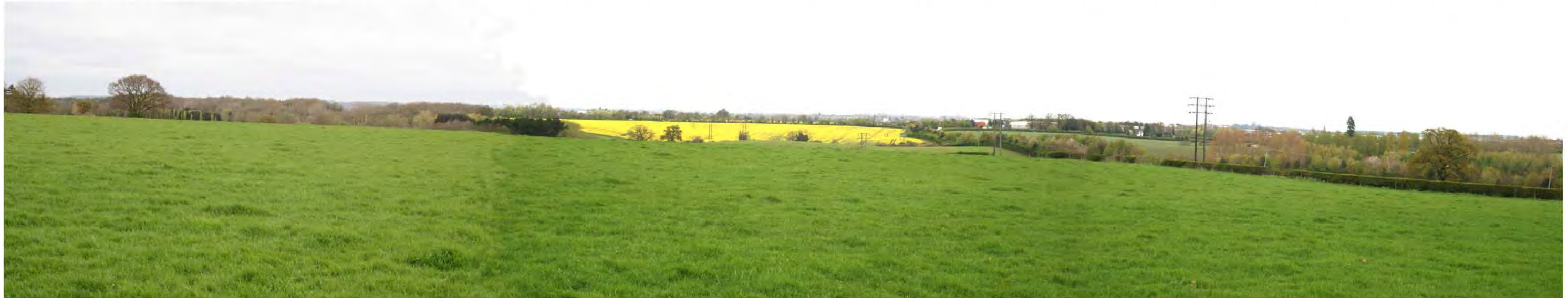
View looking north-east from near the same position - towards development at Heathcote. Note the yellow rapeseed field near Gallows Hill slopes towards the south-east and development here is likely to be prominent from the Bishop's Tachbrook direction.