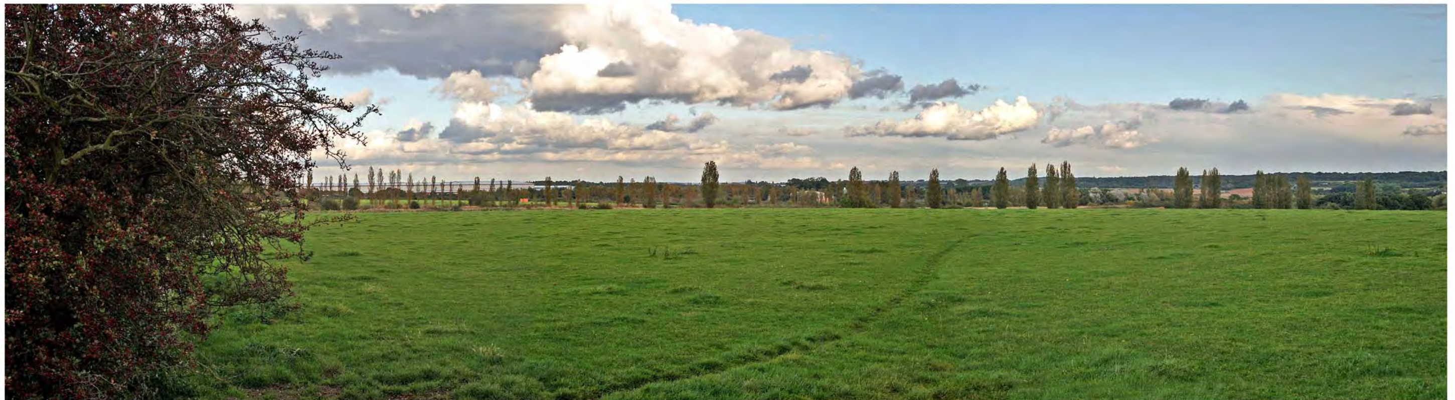
View east from near Bubbenhall bridge - with the avon valley in the distance and existing buildings at the airport to the left. The large scale development proposed in the current 'Gateway' proposal must take account of the wider landscape setting. Proposed development at Ryton and the HS2 route will contribute to cumulative landscape impacts. Appropriate landscape mitigation will be required.