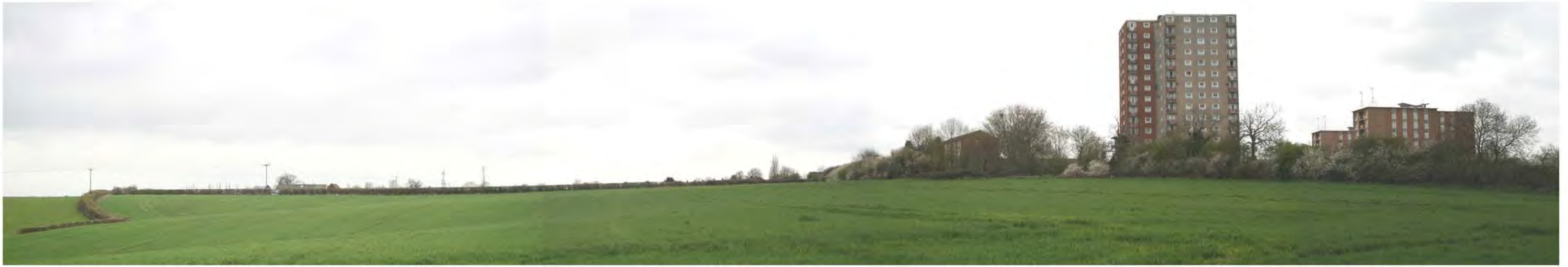
View of potential development site at Lillington - looking south-west from near Eden Court. Note existing trees and overgrown hedge that defines the present urban / rural interface.