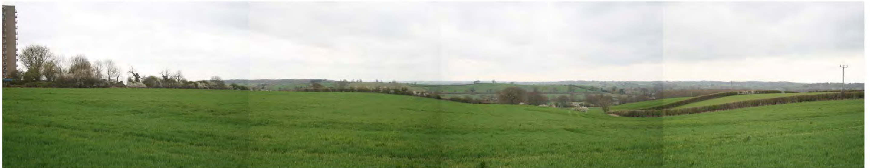
View looking south-east from the study site. A portion of the site that slopes in this direction will ideally not be developed so as to minimise potential visual impacts in the wider landscape.