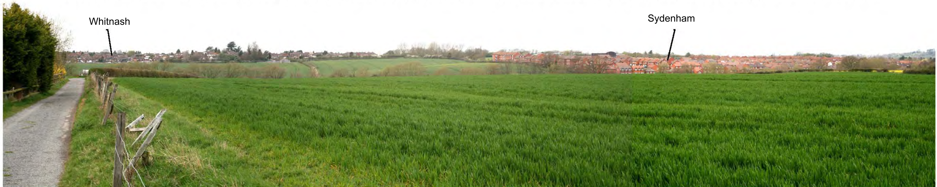
View north-west from W119 towards Sydenham and Whitnash. Expansion of Sydenham is likely to be prominent in the valley setting - but if an appropriate scale of green infrastructure is provided along the valley bottom (refer to plan B2) it might be acceptably integrated into the overall landscape.