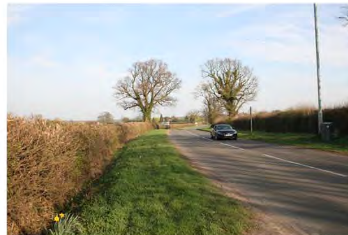
Westhill Rd has a rural character and ...