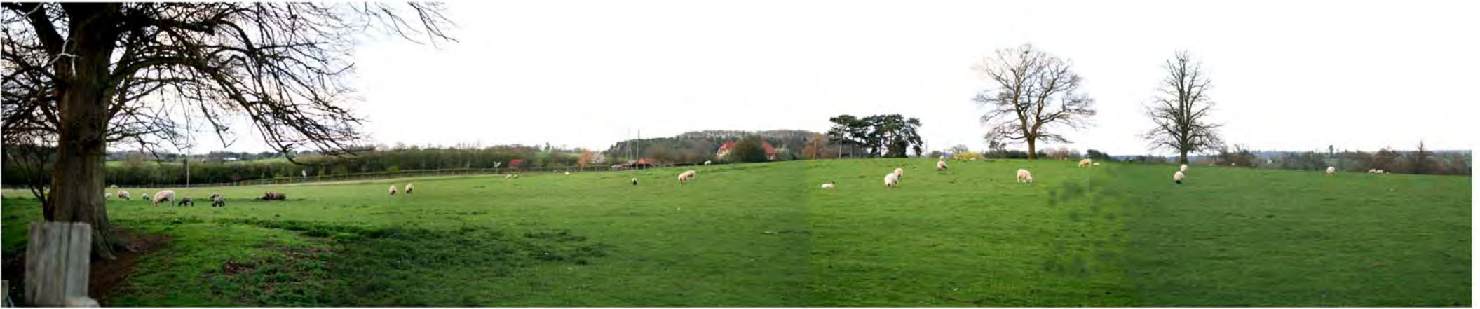
View looking north-west from Woodloes Lane. Development on this ridge is likely to be intervisible with high ground at Hill Wootton and towards Leek Wootton, as well as influencing perception of the area from the A429, Centenary Way and potentially the A46.