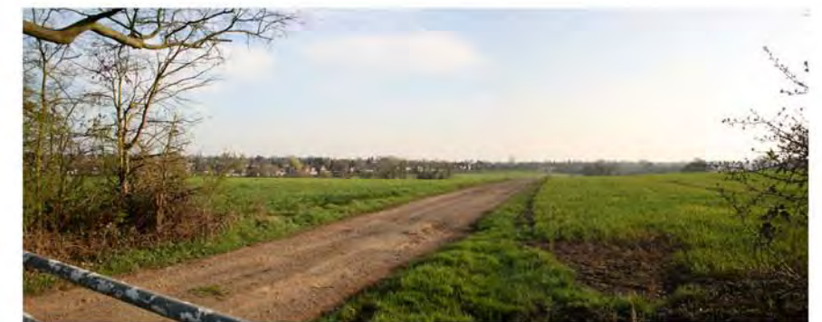
... is on high ground. Sensitive design would be required.