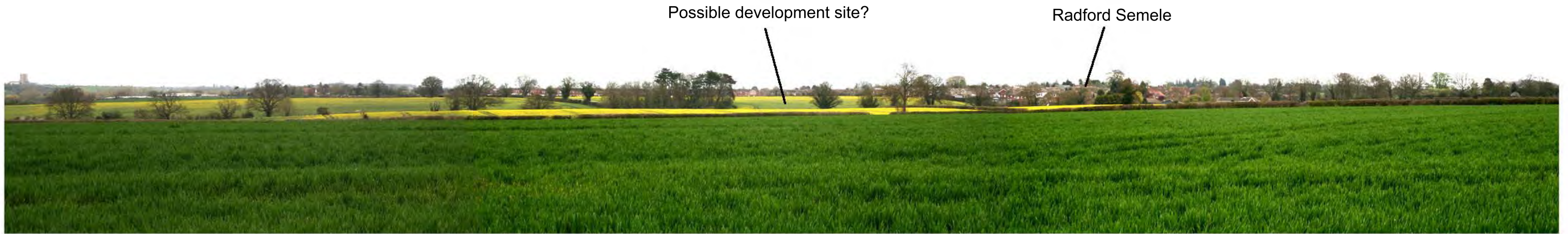
Looking north from footpath W119 over the Radford / Sydenham gap. Development on the edge of Radford would be visible here - but a significant wedge of farmland could remain between the settlements. Note distant intervisibility with Lillington.