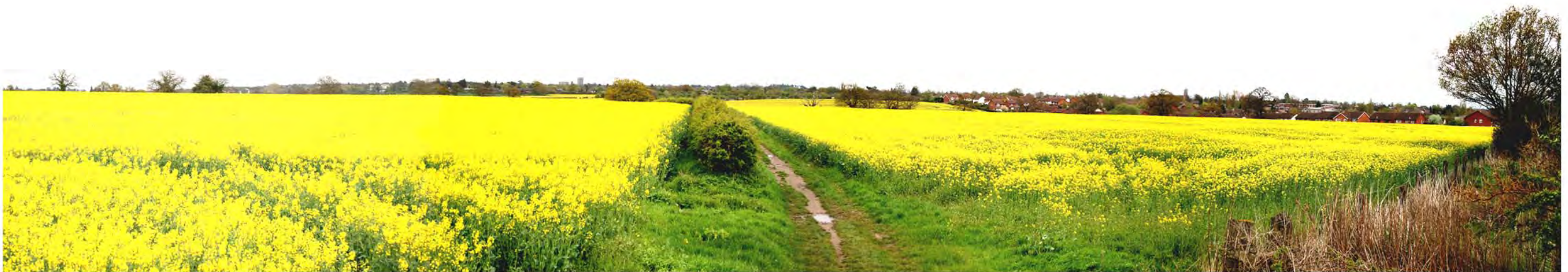
Looking east from footpath W176 near the Warwick-Coventry railway - with North Milverton visible to the right. Retaining well used community assets such as the footpath corridor will be essential in any new development here.