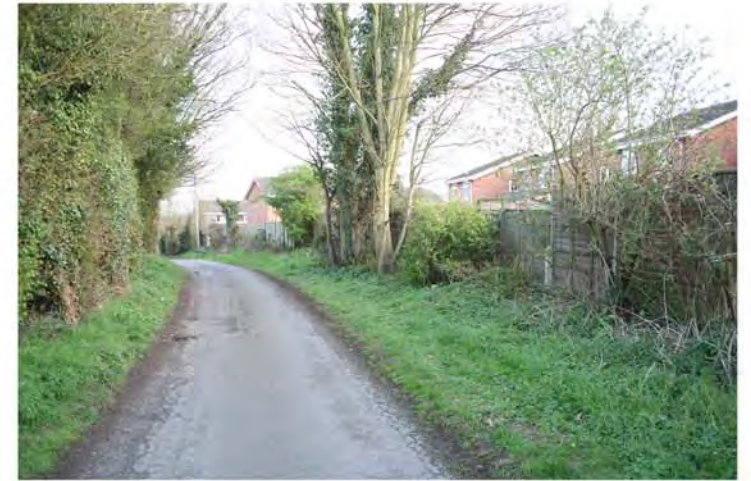
View along Woodloes Lane and Woodloes estate to right.