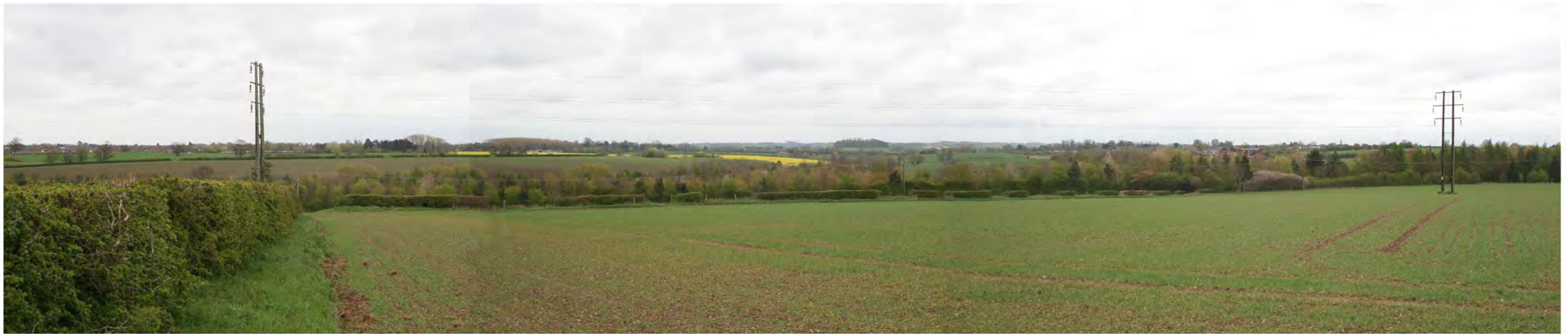
View east from public footpath at 'The Asps', south of Warwick. At 70m AOD any development on this land would be prominent and there is intervisibility with Bishop's Tachbrook and land far to the south-east.