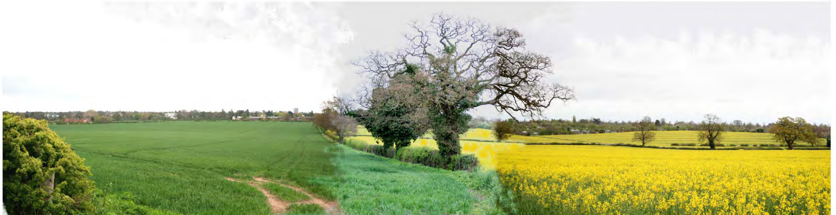
Looking south from Sandy Lane towards North Milverton. It would be beneficial to retain mature landscape assets such as trees and hedges in any new development. Note that topography drops down from Milverton, but rises slightly behind the viewpoint before the Avon valley. This might help enclose development in this area from points further north.