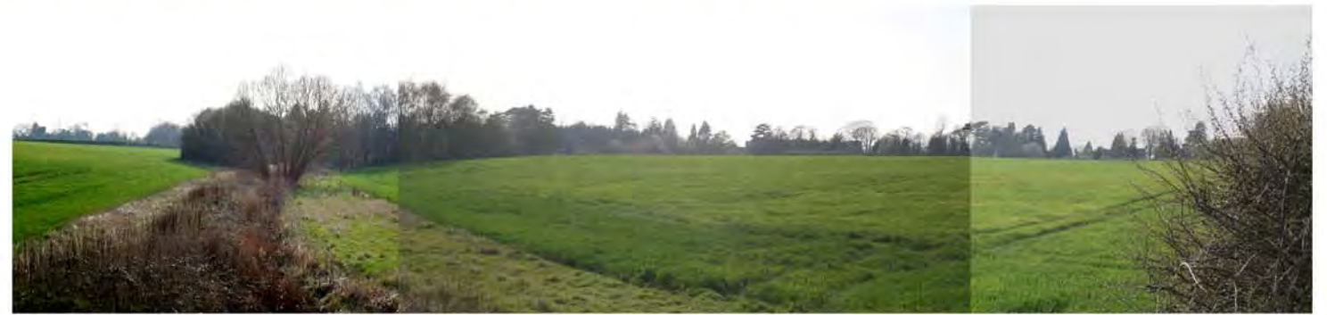
Looking north-west from Sandy Lane. The stream corridor could be enhanced.