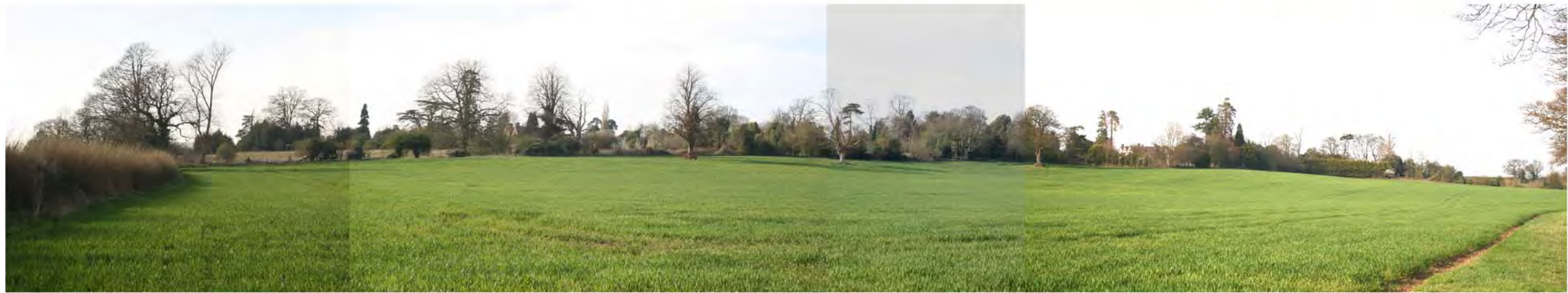
Looking north towards Blackdown Hill - with large properties and a variety of mature trees that would ideally be retained if this area was developed.