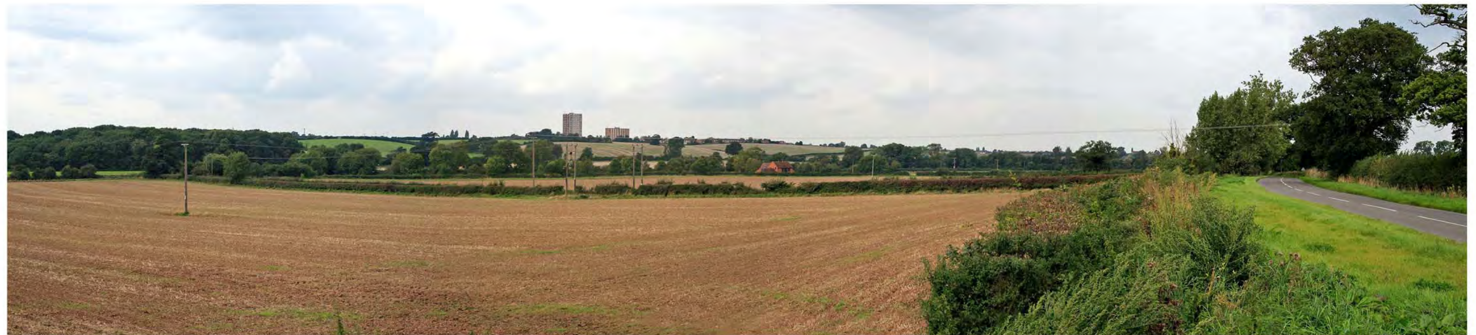
View looking west from Welsh Road between Cubbington and Offchurch. This is the direction from which views of urban expansion at Lillington might be most likely. However existing and new tree planting and the inclusion of green space could greatly mitigate such views.