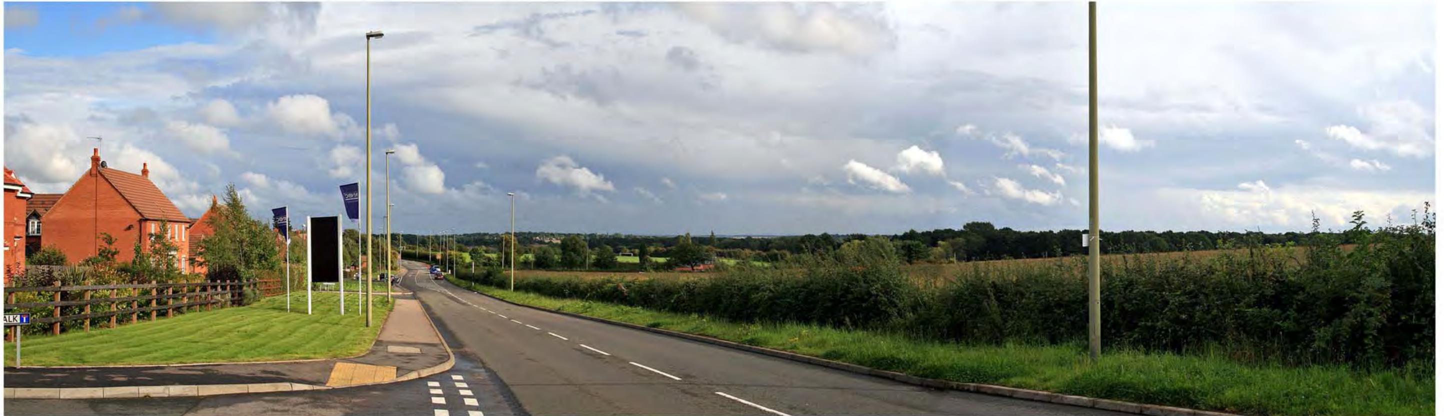
View looking east on Westwood Heath Road, south of Coventry. The road forms a boundary with the landscape gap between Coventry and Kenilworth. Warwick University has a substantial landholding within the gap, whilst the proposed HS2 rail corridor would also pass along it. However in general it is felt that the gap provides beneficial Green Belt functions and should be largely protected from other types of urban development.