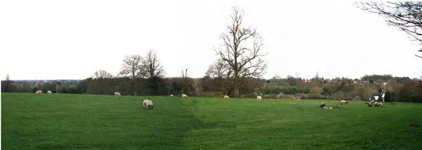
View looking north-east from Woodloes Lane. Note intervisibility with housing to the east and also the 'parkland' setting with mature trees.