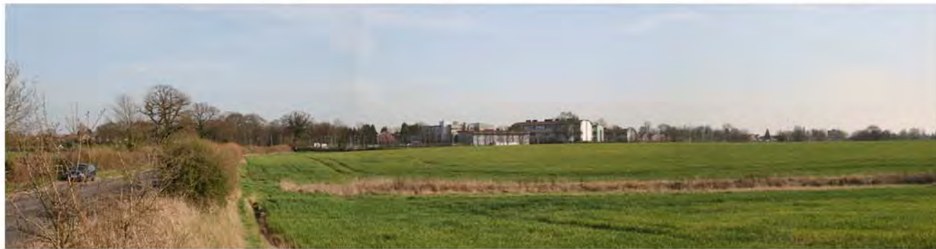
Looking south-west towards the new Leamington School from Sandy Lane.