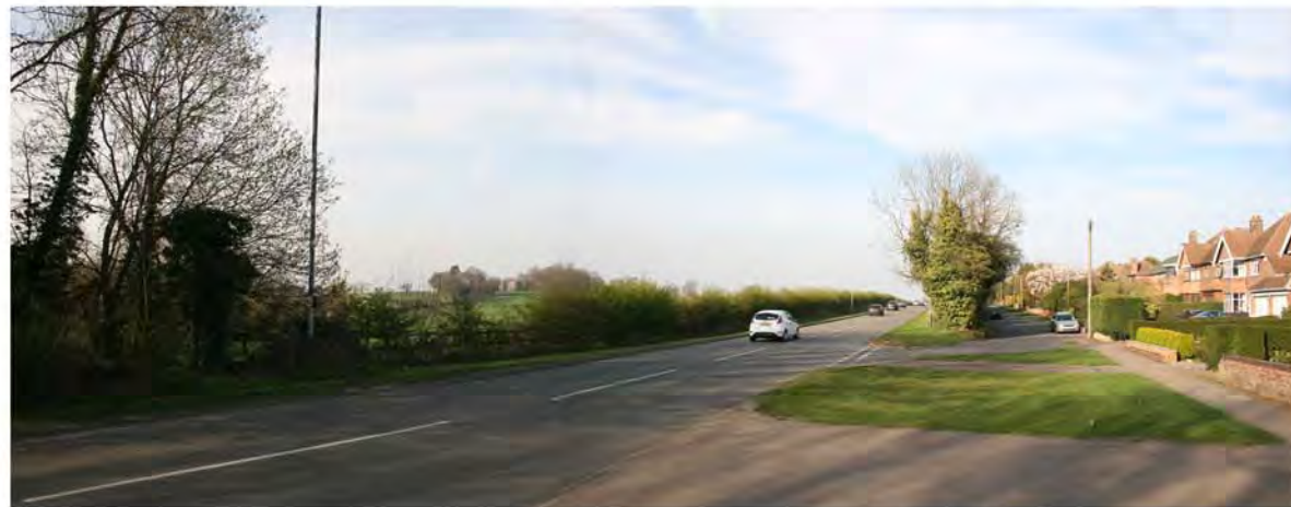
Careful design will be required to avoid adverse visual impacts along the A445.