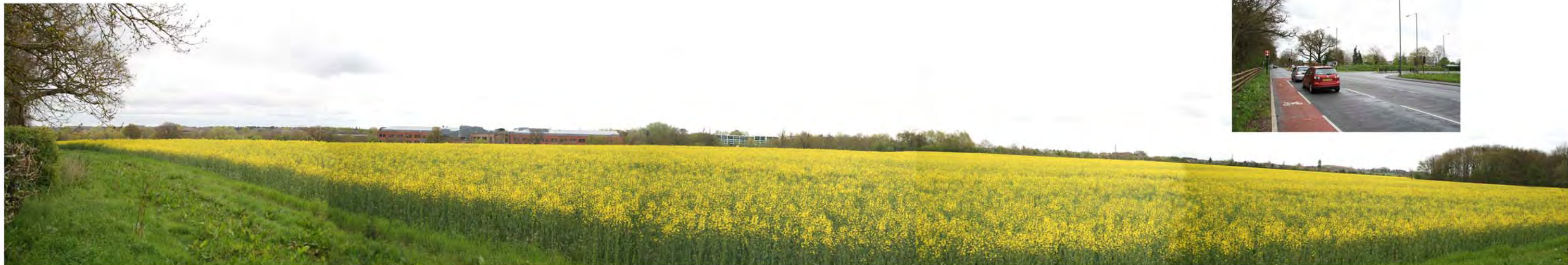
View east over arable land immediately south of Gallows Hill and opposite Warwick Technology Park. Note woodland at Turnbull Gardens to the right. Development here might be possible to enclose and integrate within a network of green infrastructure with few wider landscape impacts. Care would be required to minimise creeping urbanisation into adjacent areas with roads, lights and infrastructure (see inset).

Land at 'The Asps' and south of Gallows Hill