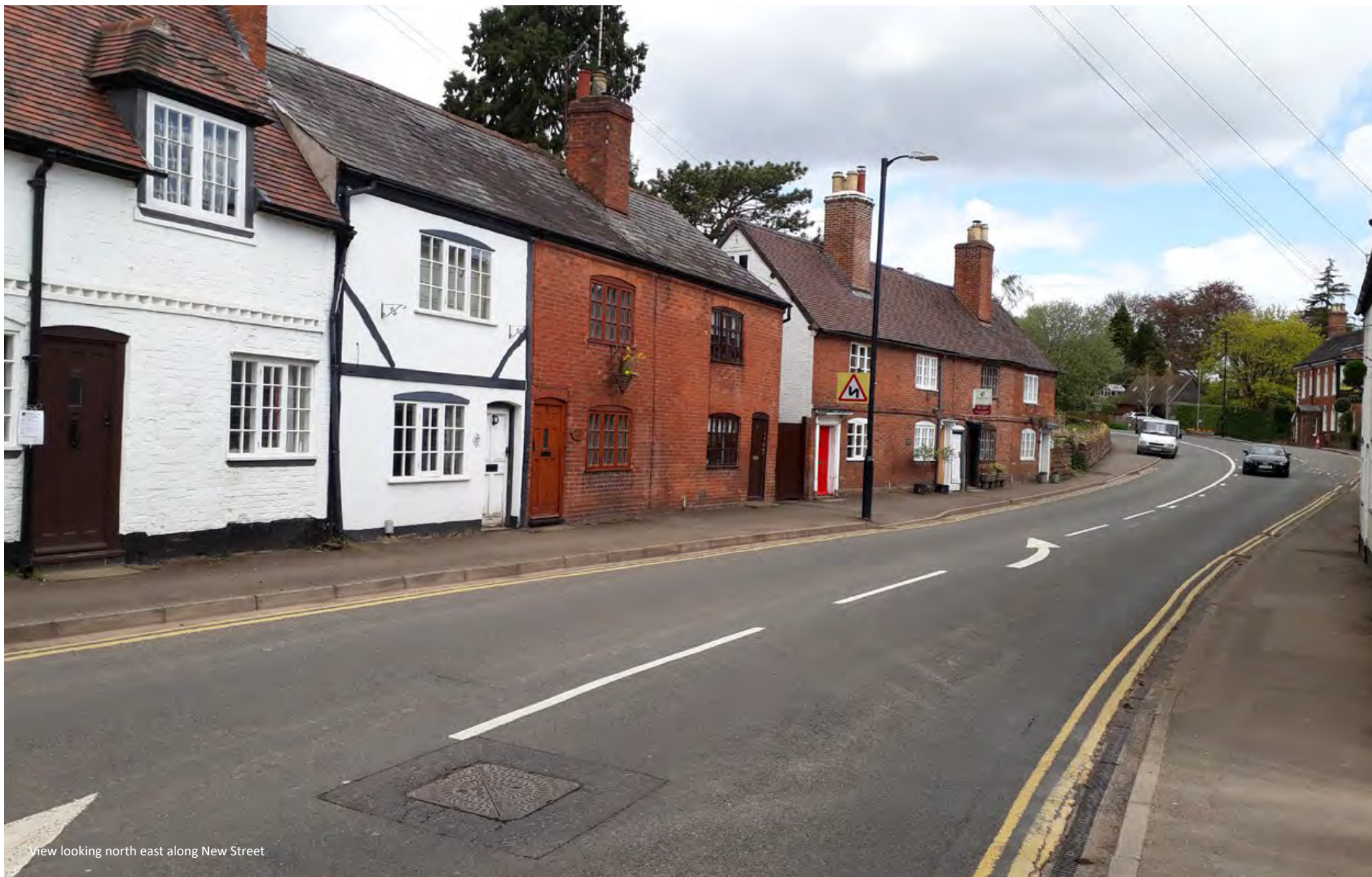
View looking north east along New Street