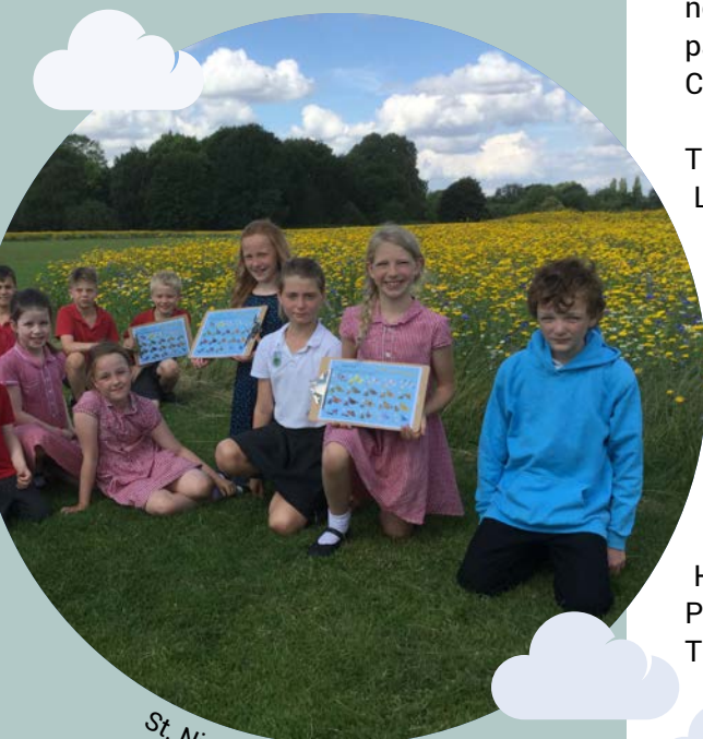
St. Nick's meadow

Postcode: CV32 7AN Parking: Cubbington Rd, Hadrian Close Public Transport: Bus 67, The Holt