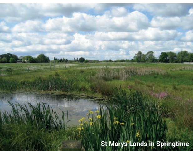
St Marys Lands in Springtime

Postcode: CV34 6HN Parking: main entrance at Hampton Street / Bread and Meat Close.