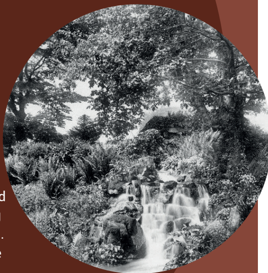
Original Rain Garden in Pump Room Gardens

We are also pleased to announce that we have a fantastic new video created by Leamington's own, MadebySonder. The short film captures a flavour of the skills and craftsmanship that have gone into restoring the original Victorian bandstand. Watch this space for details of when it is to be released.