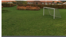
8. Football Pitch