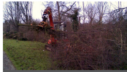
7. Tree Works