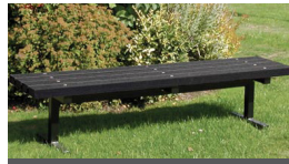
9. Street Furniture