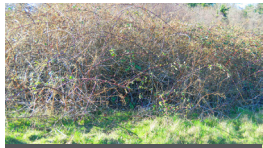
1. Vegetation management