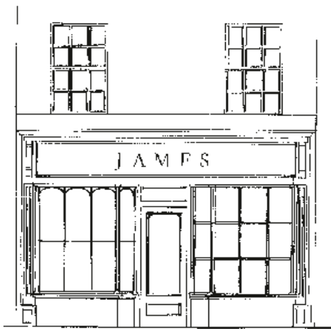
Example showing types of smaller areas of window glazing.

The information given in this document is an expansion of the information provided in the Councils HELP leaflet which is made available to retailers, and relates more specifically to steps to be taken following a criminal incident.