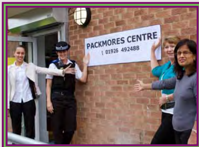
Packmores opened in April 2008 for local residents to use.