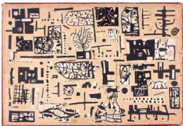
Insects' Wings © Eduardo Paolozzi, (1951). Arts Council Collection

This exhibition, one of the Arts Council's Spotlight series, includes key works of the period, such as Reg Butler's Girl and Boy (1951), Eduardo Paolozzi's The Cage (1951) and Kenneth Armitage's Figure Lying on its Side (1957), as well as works by Henry Moore and Graham Sutherland.