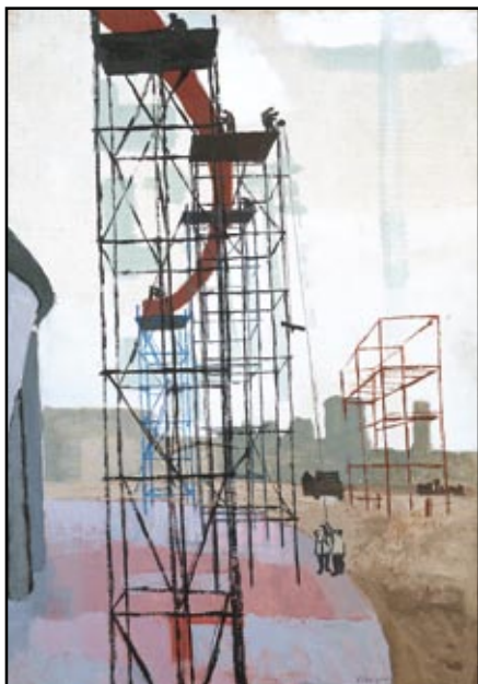
Scaffolding © John Berger, Festival of Britain (1950). Arts Council Collection

£20 per person Advance booking only, places are limited Please call 01926 742700