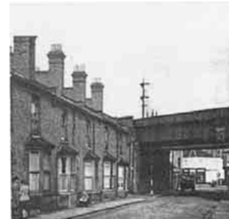
Similar view looking down Court Street taken in 1946. The traditional terraced street is still evident at this time.

Note: To same relative scale. Not a recognised scale.