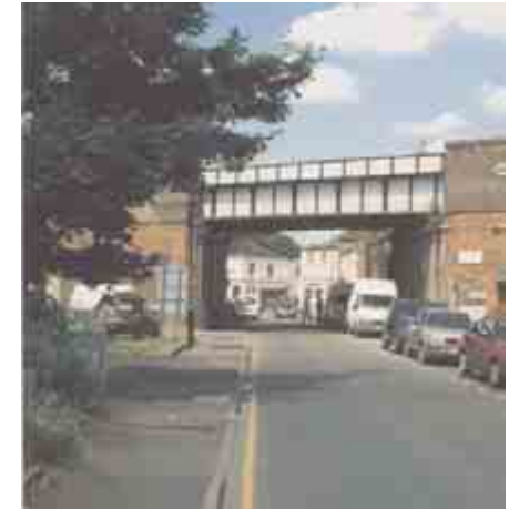
The historical street edge, like the remainder of the original community has been removed. The only legacy of this period is the Former School House, which was the focus for the community.