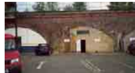
Refurbish the railway arches and seek new uses which can add life and vitality to the site.