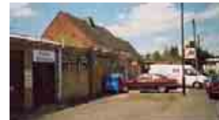
Enhance setting, condition and bring back into active use the former School House. Potential to remove Milverton House (foreground).