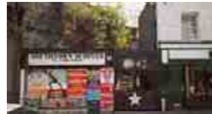
Clear away the clutter and strengthen connections to Clemens Street.