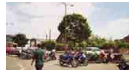
Reduce car parking provision to reflect more accurately present and anticipated use and enable redevelopment.