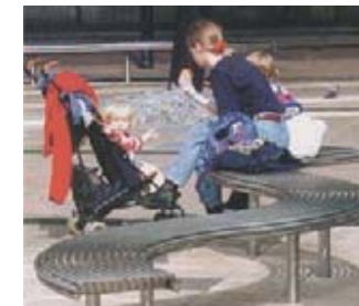
Developing the site is not just about buildings. The quality of open spaces is fundamental to peoples use of the site and places to sit and linger are encouraged.