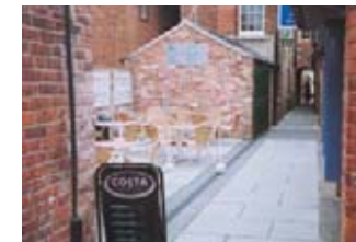
Even small spaces can be developed as people places. This café in Oswestry provides alfresco seating which transforms this alley-way