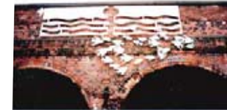
Public art can add to the uniqueness of the place

The former School House is promoted for community related uses and could provide almost 470m² of accommodation over one floor opportunities for additional space within a mezzanine may be possible.