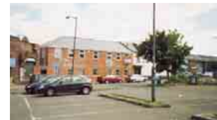
The Council owned car park site