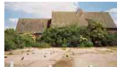
The yard to the Stoneleigh Arms