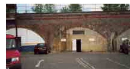
The railway arches require access but add no vitality