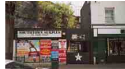
The Council lease this unit fronting Clemens Street