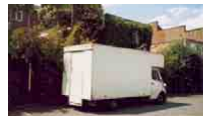
Access to the rear of properties on Clemens Street is required