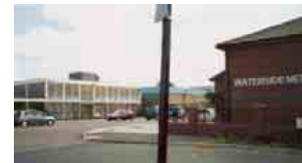
Waterside Medical Park provides a key community use close by