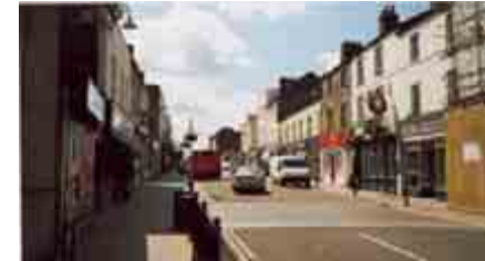
Recent refurbishment of Clemens Street sets the tone for quality