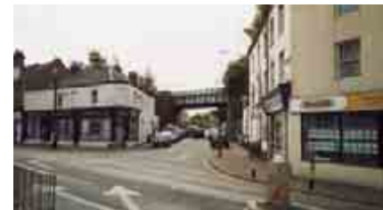
The site is within the Town Centre's Commercial Core