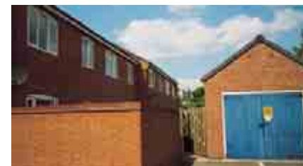
New development should take account of existing uses