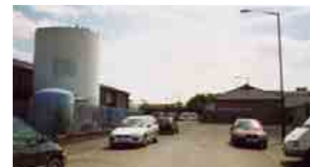
The employment area would benefit from environmental improvement

© Crown copyright. All rights reserved. Licence number AR 100018269