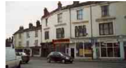
The conservation area is key consideration to the west of the site