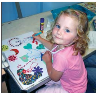
Summer Art Club

Get creative during the School Holidays and be inspired by the CLOCKING ON exhibition! Our Summer Art Club is very popular and offers families the chance to try out different art activities every week.