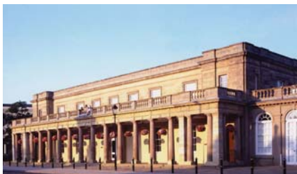
The Royal Pump Rooms

The Tea Rooms are among Leamington Spa's finest venues, with a lovely ambience and style and a menu to match.