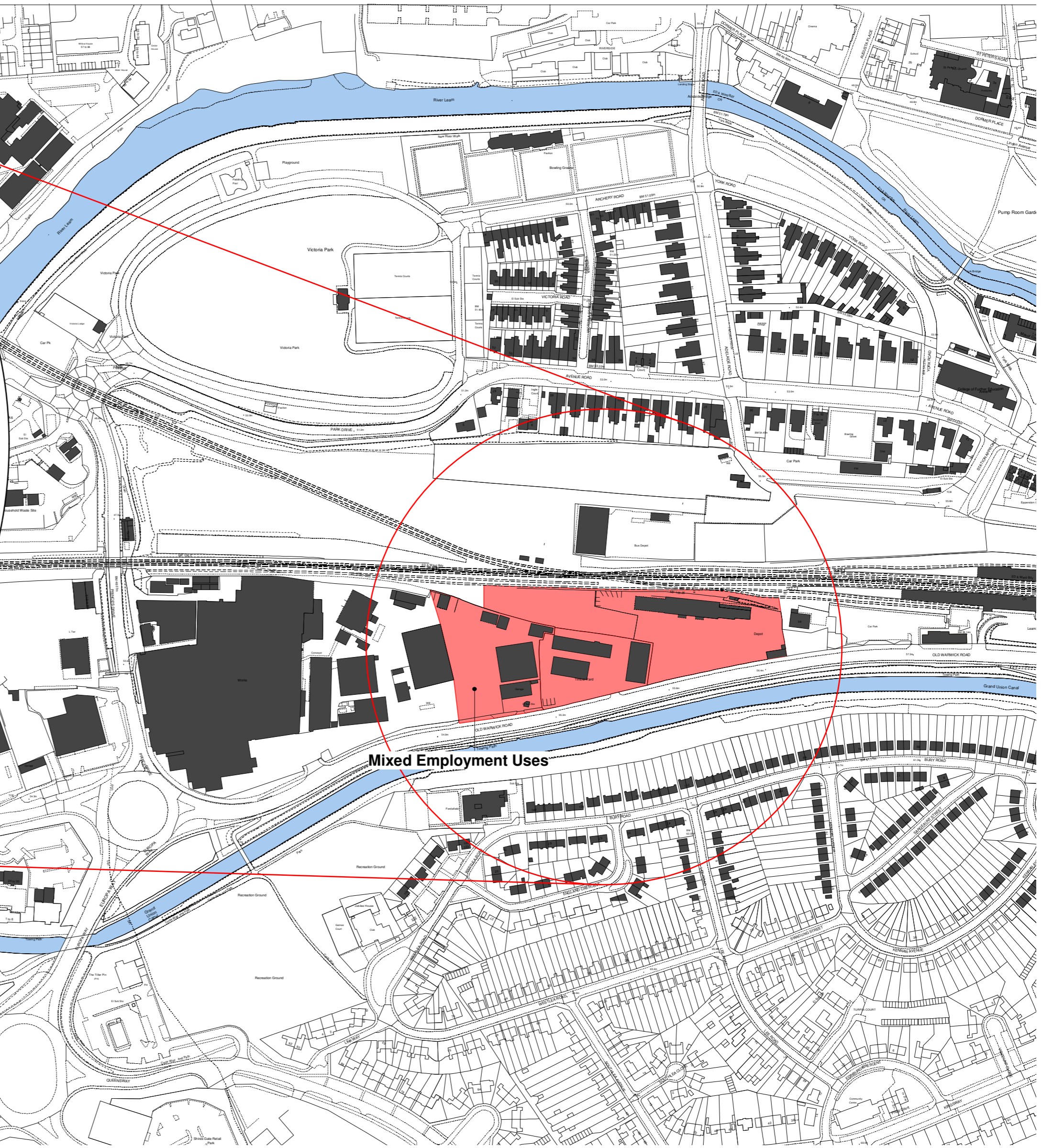
Mixed Employment Uses