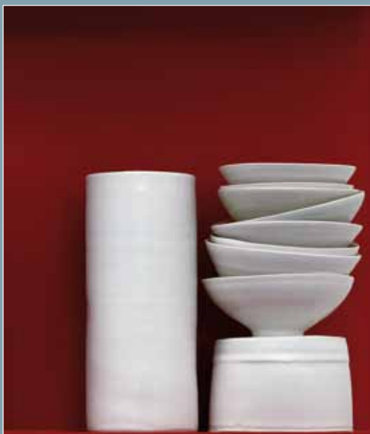
After the Flood (detail) © Edmund de Waal