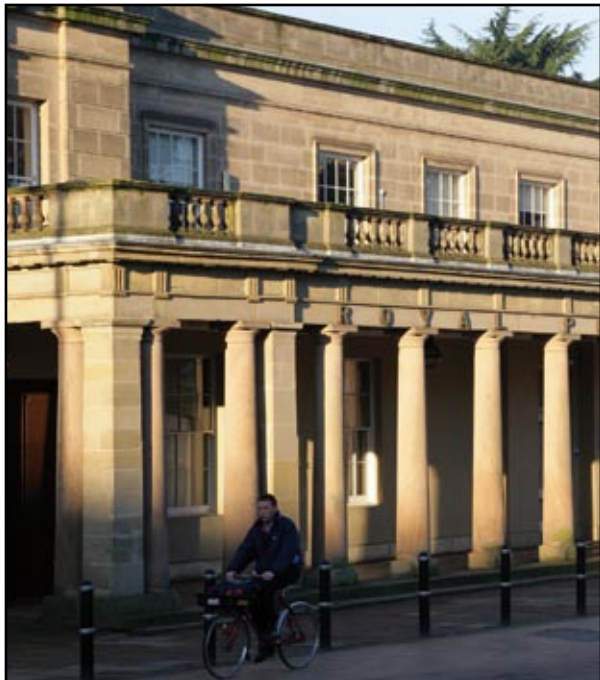
The Royal Pump Rooms

The Tea Rooms offer a menu including lunches, a range of cakes and pastries, and tea and coffee.