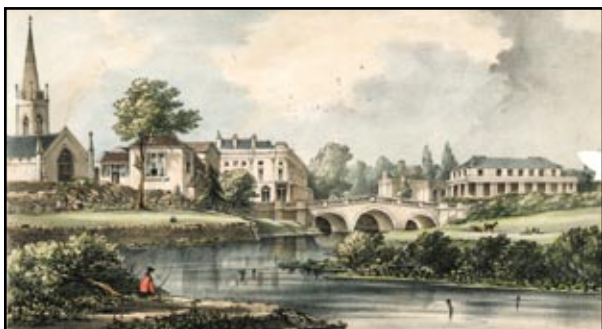
Leamington From The Mill. Colour print by J. Rider (c.1814 – 1861) © Leamington Spa Art Gallery & Museum

www.lsamcollections.org.uk . You can also access the website from the computers in the art gallery.