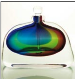
Perfume Bottle by Chris Comins

The Art Gallery & Museum stocks a selection of greetings cards, postcards and publications on the visual arts and local history. Browse our contemporary craft showcase to discover beautiful handmade items that make perfect gifts!