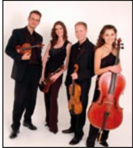
Carducci String Quartet

Beethoven, Quartet in C Op 59 No 3 Razumovsky