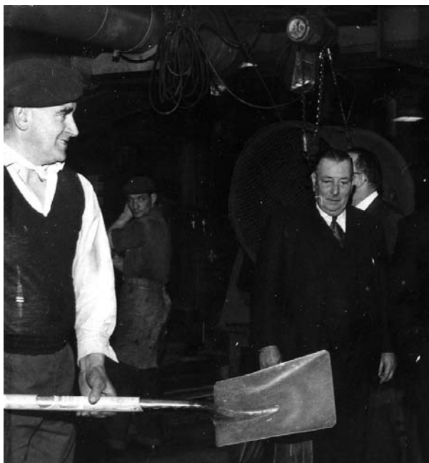
The Leamington Spa Ford Imperial Foundry Site

Share the experiences of local people and discover what an average day at work was like in the 20th Century. Find out why people moved to the region to find work and learn how working life impacted on leisure time.