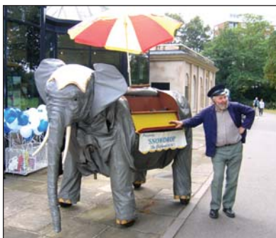
Snowdrop the Elephant