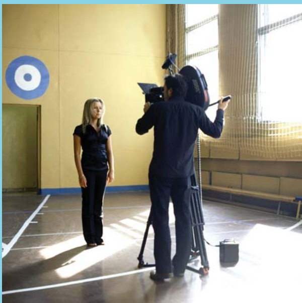
The Girl with X-ray Eyes - Diptych one. Photograph, Zhenia Sveshinsky © Phillip Warmell, 2008