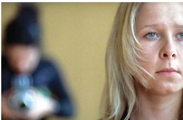
The Girl with X-ray Eyes - Film still © Phillip Warnell, 2008

Artist Phillip Warnell uses the body as a site of exploration producing works using performance, images, and sound. His work is distinguished by its attention to detail, to scrutiny, to humour, to technique and to the complex relationship between live performance and the mediated image.