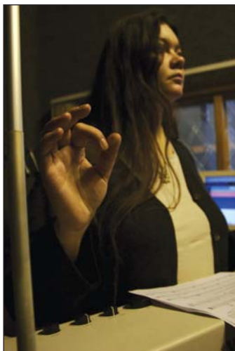
Theremin player.

Please call 01926 742700 to reserve your place.