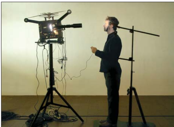
Unseen Footage – Performance. Photograph, Stéphanie Nava © Phillip Warnell, 2007

Phillip Warnell will discuss his work and the current exhibition, INTROSPECTION - EXTRAMMISSION. The event will be followed by a live art performance. This event is part of the Visual Arts & Crafts programme funded by the Arts Council England and local authorities in Coventry, Solihull and Warwickshire. £3 per person, advance booking only. Please call 01926 742700 to reserve your place.