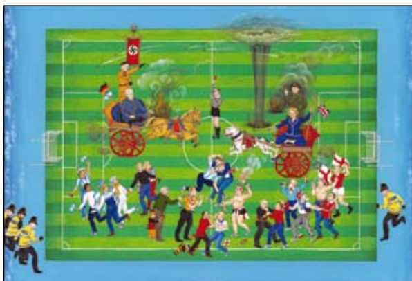
In Action Replay , 2002 © The Singh Twins ( www.singhtwins.co.uk )

Alongside some of their better known paintings the exhibition will feature two short films produced and directed by the twins. These films demonstrate a new development in their work, exploring their creative ideas and British Asian Sikh identity through the world of moving imagery.